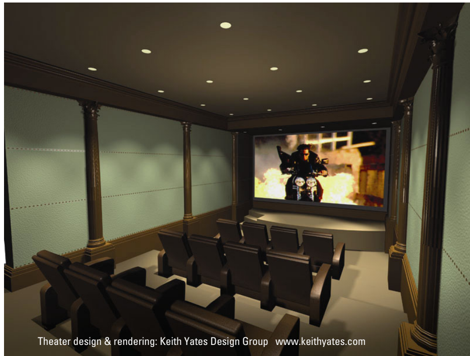
Theater design & rendering: Keith Yates Design Group www.keithyates.com

Recording studios, rehearsal spaces, jam rooms, professional production, editing & postproduction suites