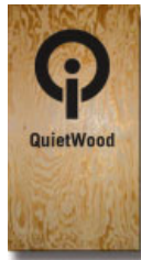
QuietWood™ - soundproof panels for sub-floors, exterior walls & booths